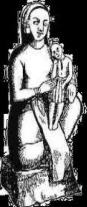
Babylon - Semiramis and Nimrod/Tammuz

A halo or sun-disk about the head - denotes sun-god worship.