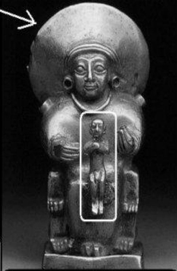
Mother and Child Worship

A halo or sun-disk about the head - denotes sun-god worship.